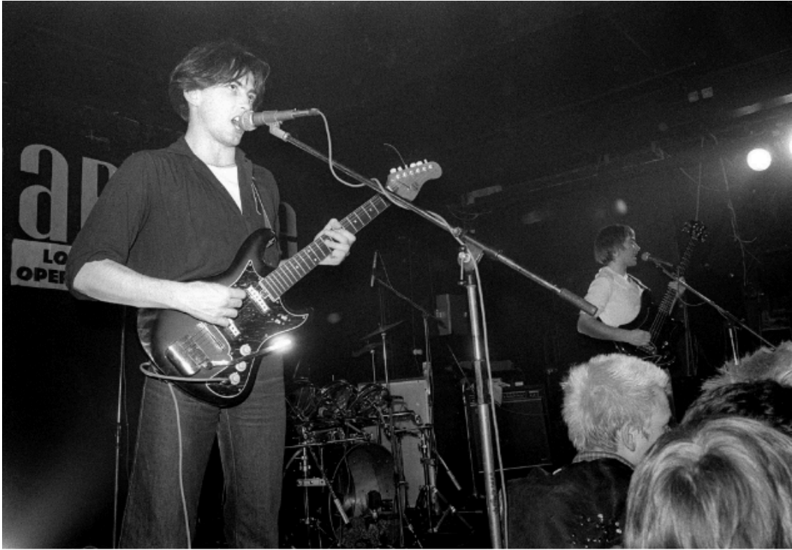
The Cure at the Marquee Club, London 1979.

Speaking of that, when you're playing "Just Like Heaven," do you ever pause and think, "This is a perfect song"?