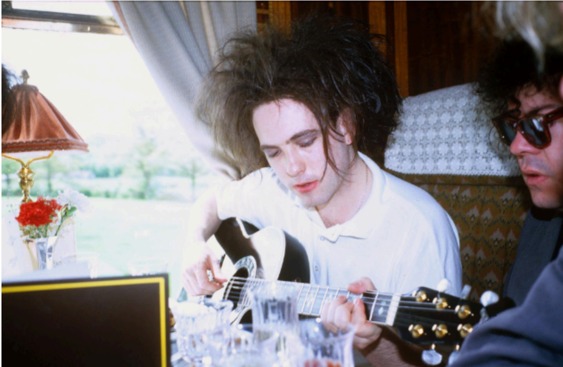
The Cure on the Orient Express at Victoria Station, London 1986.

You closed out the Hyde Park concert with “Killing an Arab.” Even though it’s based on Camus’ The Stranger , that song has faced a lot of controversy over the years. How do you feel about it now?