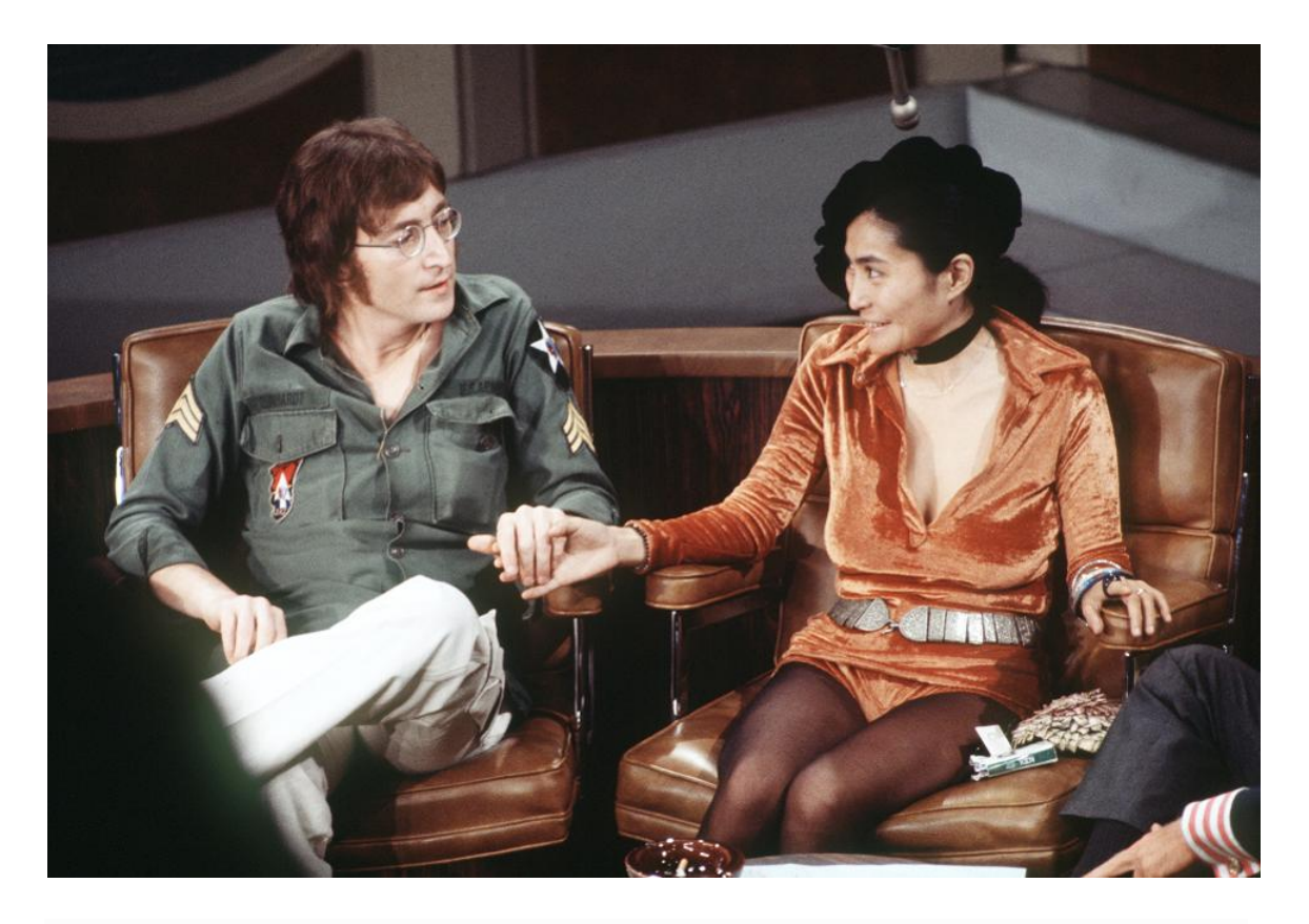
UNITED STATES - SEPTEMBER 24: THE DICK CAVETT SHOW - 9/24/71, John Lennon and Yoko Ono chatted with host Dick Cavett., (Photo by Ann Limongello/Walt Disney Television via Getty Images) WALT DISNEY TELEVISION VIA GETTY IMAGES

But the Lennons didn't insist on staging or airbrushing. Bedroom scenes and bathroom moments are far from flattering, but they also convey a stripped down honesty that serves to reset viewers' preconceived notions about the couple, making their partnership and mutual contribution to the song "Imagine" more obvious. The film captures their collaborative efforts and the fact that the song is, as Epstein notes, a "marriage of John and Yoko" where the song is very much Ono's voice.